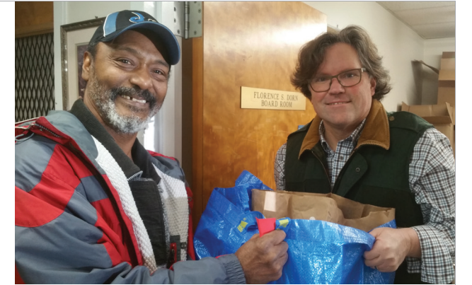
↑ A holiday food basket recipient thanks an ACSGW volunteer for the special Thanksgiving meal he received on November 25, 2019.