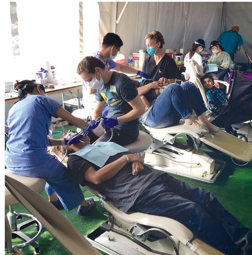
↓ Volunteers provide dental care as members of the Navajo Nation fill the exam area.

Many people traveled for hours to attend the dental clinic because of scarcity of quality dental services on reservations.